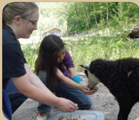
> Raising Lambs