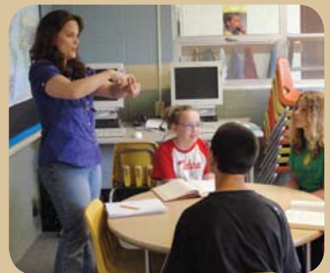
> Sign Language